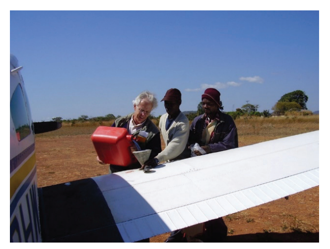
Refuelling the aircraft in the bush