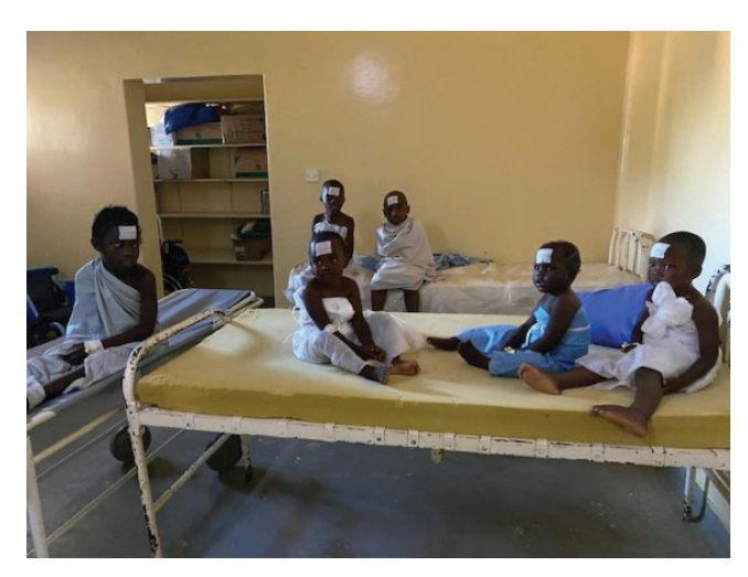
Young children awaiting surgery at Mazabuka Hospital