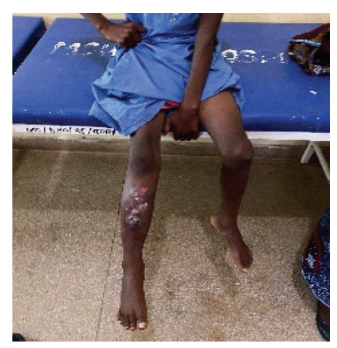
This young girl has Chronic Osteomyelitis (COM) – infection of the bone. It is very common in both children and adults in Africa. Surgery enables dead bone to be removed to allow healing.