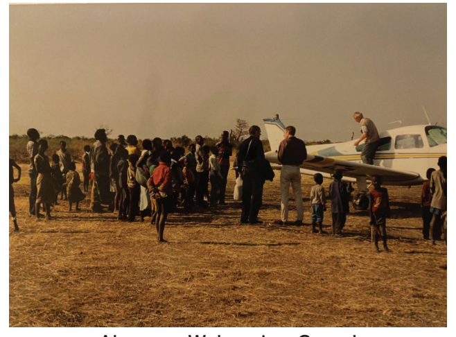
Always a Welcoming Crowd