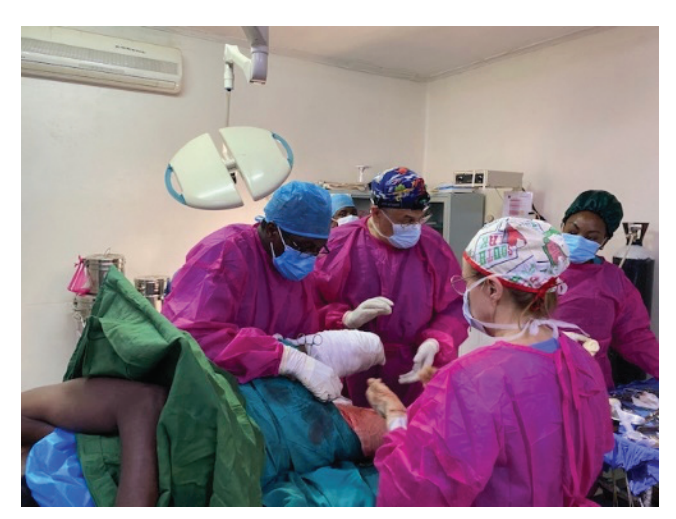
FlySpec doctors working with Mazabuka staff to skin graft this young man's lower limb amputation stump after recovery from severe infection post trauma.

Combined specialist orthopaedic and plastic surgery at Chitokoloki Hospital saved this young man's severely fractured arm following a serious Road Traffic Accident. The flap joining his left wrist to his abdomen remains for 3 weeks to provide blood supply to the large area of skin loss at the wrist to allow healing.