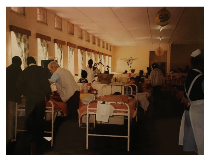
Post Op Ward Round before Flying Home