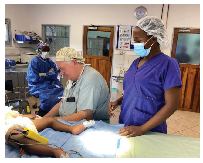
Last minute preparation before the start of surgery