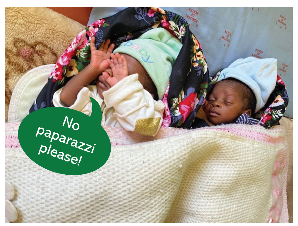
Newborn Twins at Chitokoloki.