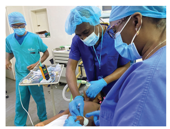
Vital Monitoring using the Life box during paediatric anaesthesia at Mazabuka Hospital

This equipment is now used to monitor Mazabuka patients during general anaesthesia improving intra operative patient safety.